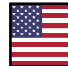
Percentage of U.S. Employed who Teleworked due to the Pandemic

The ability to work from home partly separates the income haves from the have-nots during the pandemic.